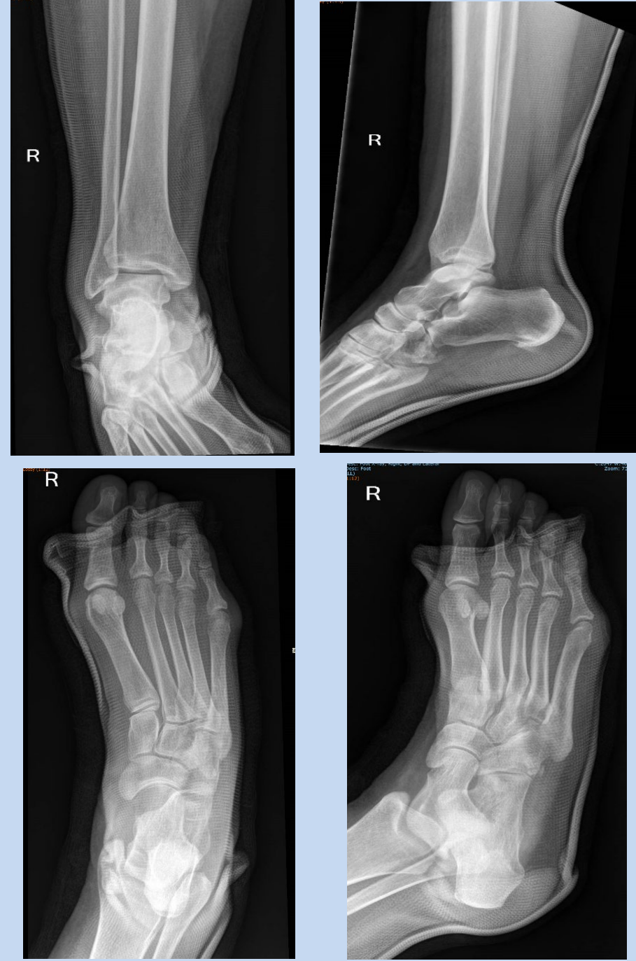
Figure 2. Post-reduction radiographs of the right foot and ankle