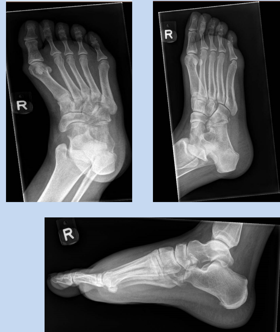
Figure 4. Post-discharge radiographs of the right foot